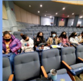
CAUSE visits local colleges