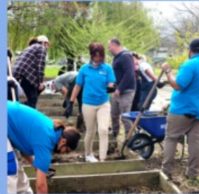
Tree Plantings in Camden