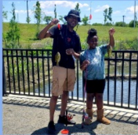
Free Fishing Day @ Cramer Hill Waterfront Park