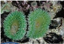
Green Sea Anemone

Some animals like colder water, some like it warm. Find the animals below. Is their water cold or warm? Circle the correct answer