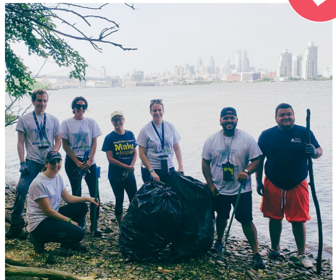
Petty's Island clean up with CAUSE youth and American Water staff, 9/20/2021